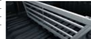
Sliding Bed Divider